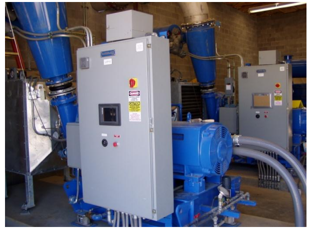
Single Stage Turbine Blowers

The Jet MCR process began receiving influent flow to one train in November of 2005. During the bidding process, an addendum was issued replacing the originally specified multi stage centrifugal blowers with single stage turbine blowers. This was done in the hope of saving power.