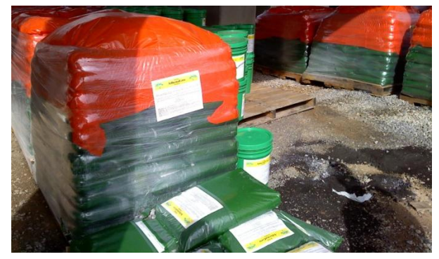
AthenaGro Fertilizer Ready for Sale

Operators report that by allowing the Jet MCR to operate in automatic mode, they can achieve 60% to 70% biological phosphorous removal, and build the phosphorous concentration in their sludge to a minimum of 5%.