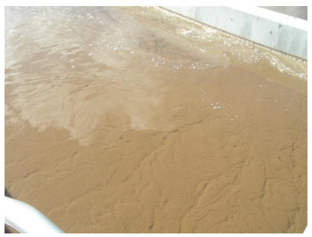
Excellent Floccing Sludge in Jet MCR

Ferric chloride is fed to the clarifier effluent for phosphorous polishing on the final disk filters before discharging the effluent to Oostanaula Creek.