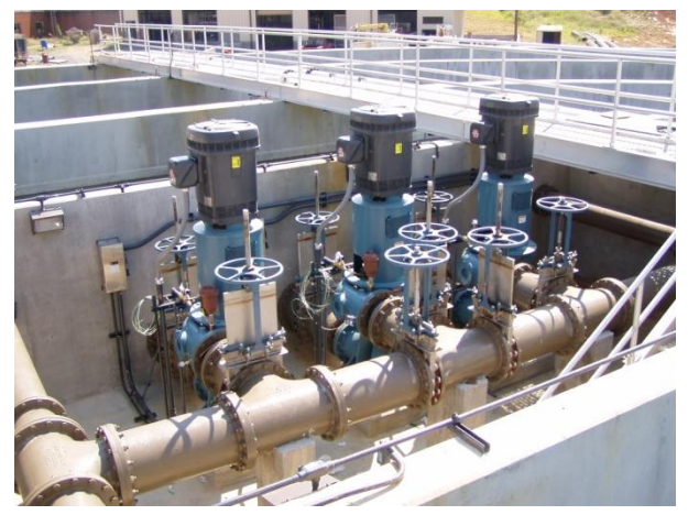
Vertical Dry-Pit Jet Motive Pumps

The total volume of each basin is 3 MG. Basins have an operating side water depth of twenty feet. Motive liquid for the aeration/mixing jets is provided by two vertical dry-pit pumps. There is also a common on-line spare pump. Each pump provides motive liquid to a single bank of twenty-eight jets.