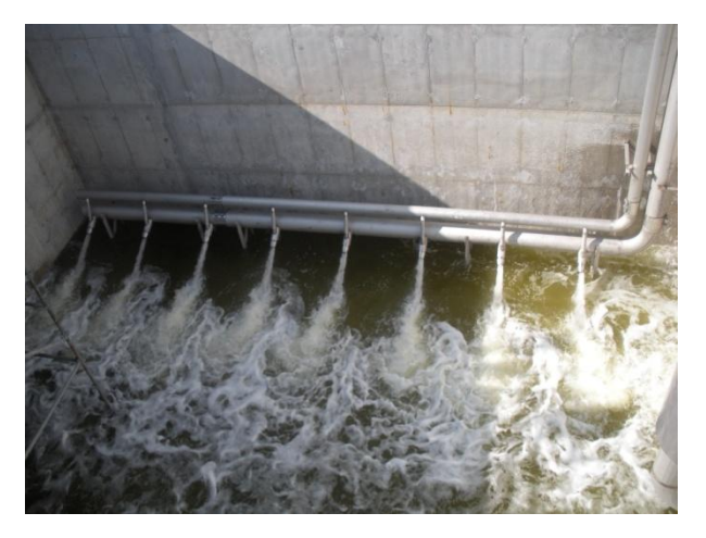
Stainless Jet Aerator/Mixer

Recently, Fluidyne began fabricating jet aeration and mixing headers from type 304 stainless steel.