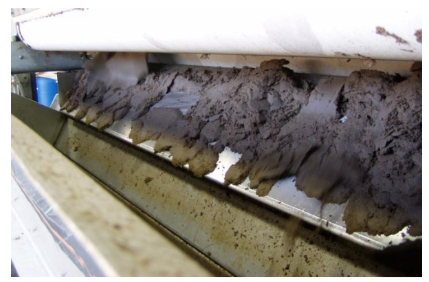
Filter Cake on Belt Press

The filter cake is conveyed to a gas drying system where 95% of the moisture is removed. The dried sludge is bagged and sold as a slow release 5-5 fertilizer.