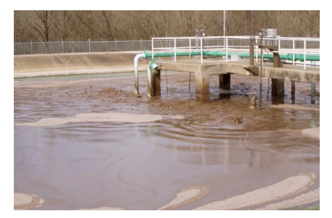
Jet Aerated Aerobic Digester

The filter cake is conveyed to a gas drying system where 95% of the moisture is removed. The dried sludge is bagged and sold as a slow release 5-5 fertilizer.