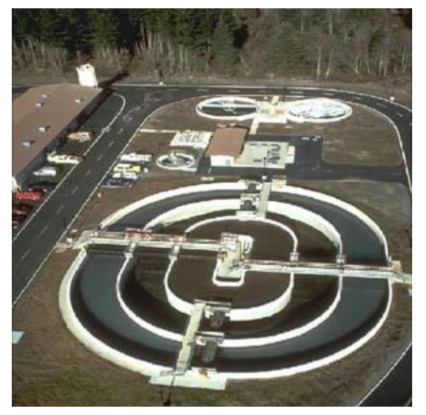
Multi Channel Reactor with Surface Aerators.

operates in the nitrification denitrification mode of the outer channel. In periods of low load, the dissolved oxygen concentration in the "swing" channel increases and the channel serves to accelerate the aerobic processes. The flow then passes through another transfer port to the inner channel. The dissolved oxygen concentration in the inner channel is maintained at 2.0 mg/L or more to complete carbonaceous removal and nitrification.