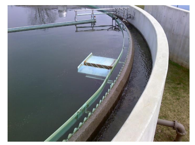
Center Feed Final Clarifier

Effluent from the Jet MCR goes to four center feed clarifiers. Return activated sludge from the clarifiers is fed to Jet MCR influent well.